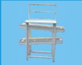
On Line FIFO