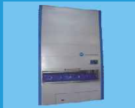
Auto Store Lift