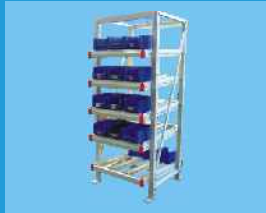
FIFO Storage Rack