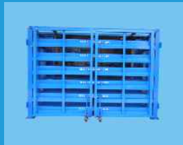
Sheet Storage Rack