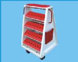
CNC 'A' Type Trolley