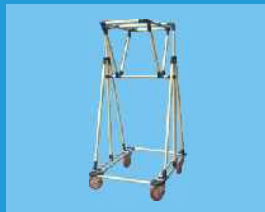
Pipe & Joint