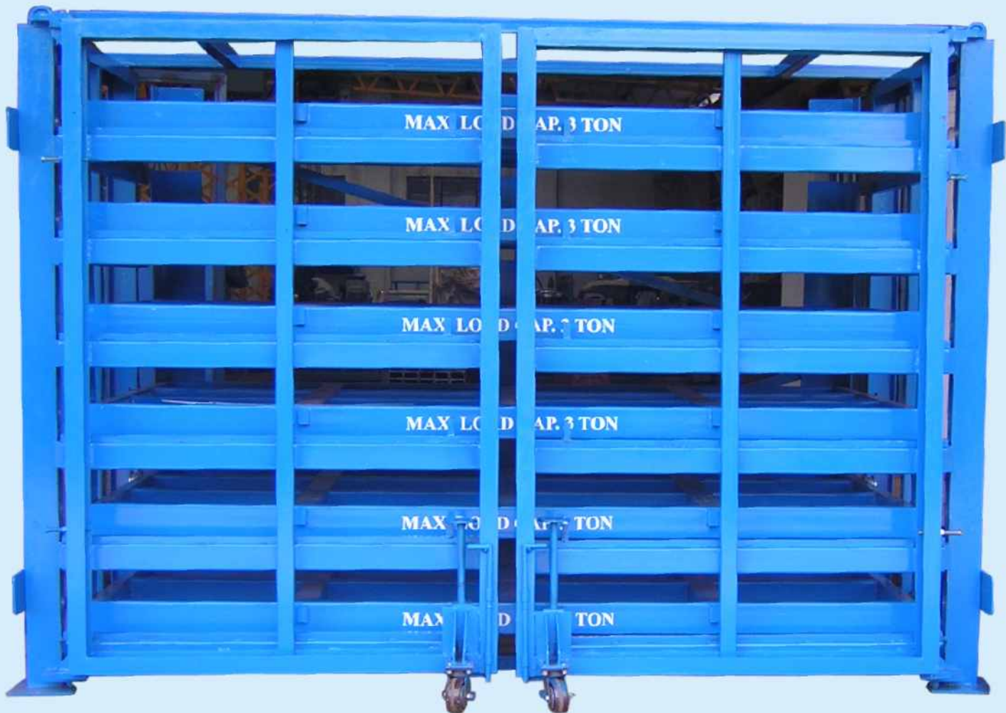
Rack In Close