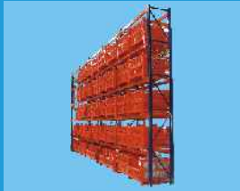
High Rise Storage