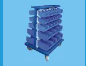
FPO Bin Trolley